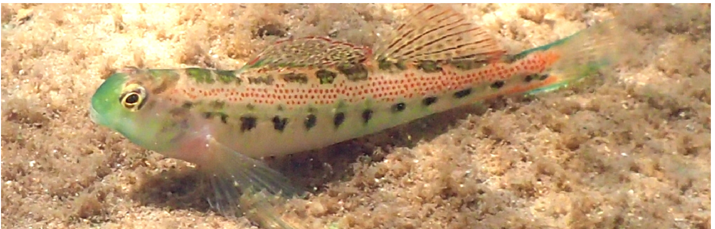
Redtail Chub, Striped and Tennessee Shiners top photo. Duck Darter bottom photo.